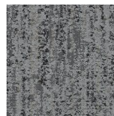
Silver 01535 LRV 14.9