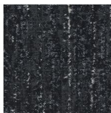
Medina 01505 LRV 6