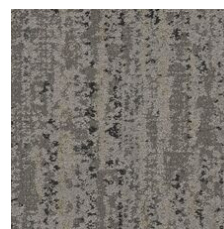
Riad 01518 LRV 14.5